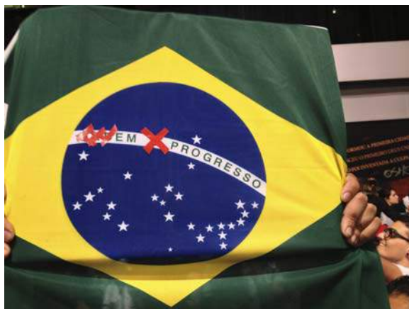
FIGURE 4 Brazil in progress. Banner at protest on Avenida Paulista, São Paulo, 20 June 2013.

presence raise questions about whether the money may be better spent improving basic foundations for society? Likewise, whether the money may be better invested in ensuring that Brazil's progress is universal and benefits everyone equally (figure 4)?