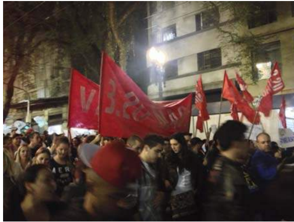
FIGURE 1 Protests in Praça da Sé, São Paulo, 18 June, 2013.

and bars across the country expectant. In an impressive turnaround, Brazil seemed prepared for the world's gaze and, moreover, ready to assert itself on the global stage.